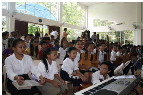
The congregation was profuse in praising our God Lord Jesus, the Author, Sustainer & Finisher of this ministry