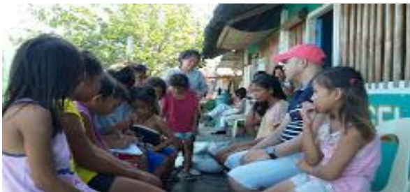
Children praying to receive Jesus Christ into their hearts.