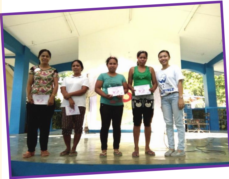
San Joseph Elementary School mothers showing certificate of participation