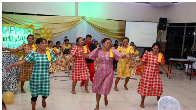
The "Romeo & Juliets" of C.A.R.E., Philippines doing the seagulls' dance