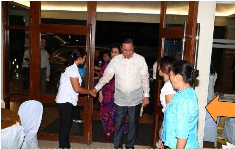
Beaming with smiles, the celebrant was ushered in by the happy greeters