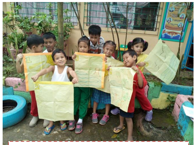
“God Made Me,” a drawing activity by the children of Buso-Buso Elementary School