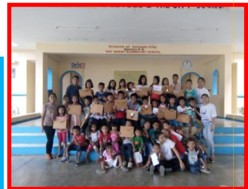
DVBS graduates from Kaysakat Elementary School