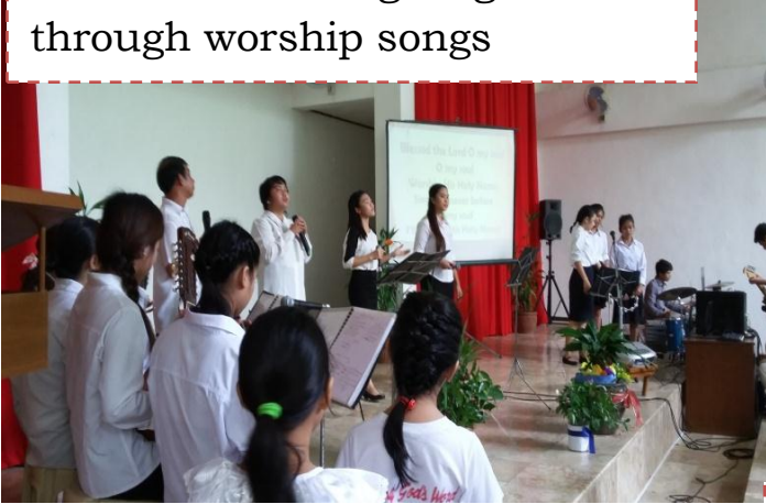
Our Music Team giving thanks through worship songs