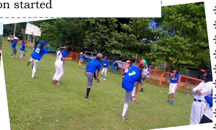
And the group during the competition!