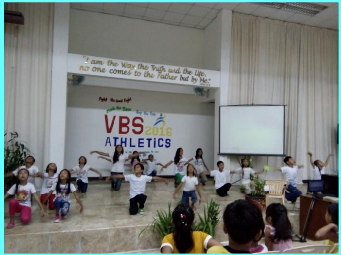
"Runners" dancing to the tune of "The Power of Love Your Love."