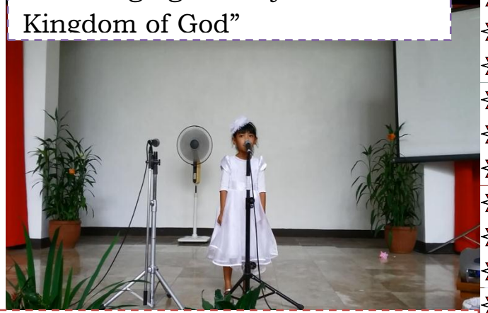
Vida singing "Seek ye first the Kingdom of God"