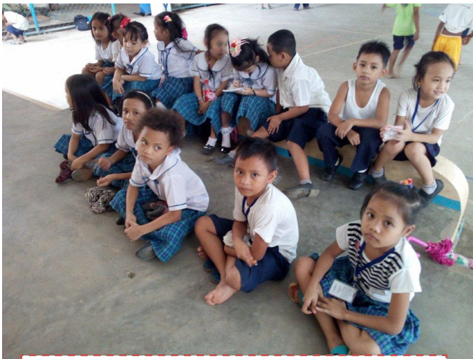
The students from San Joseph, while listening to the Word of God.

Please pray with us for these precious children of the Lord.