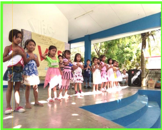
"Racers" singing "Turn my eyes away from worthless things"

As coaches, we couldn't help but be amazed at how God works in the children's hearts. Their interest in the word of God is tremendous. They came early, invited friends, prayed sincerely, enjoyed answering their journals, danced excitedly with us and always looked forward to another class the next day. Their smiles are contagious. We were once like them who attended Sunday Schools. We realized we want to see them lead VBS someday too. After that fifth day, we are sure that day won't be the last.