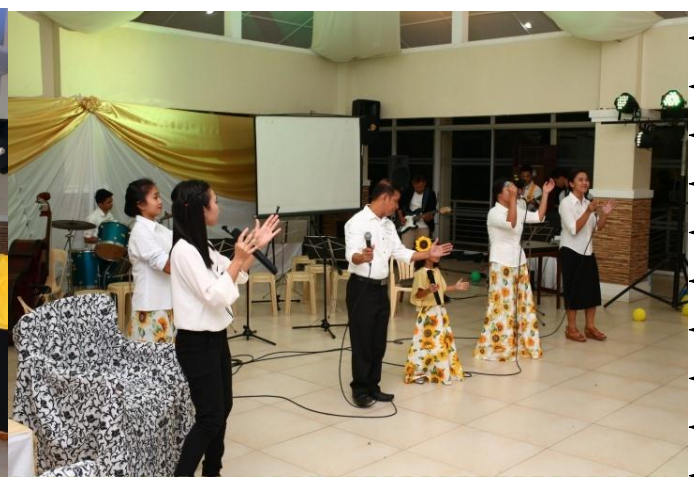
Our Music Team praising and thanking to our Lord Jesus Christ