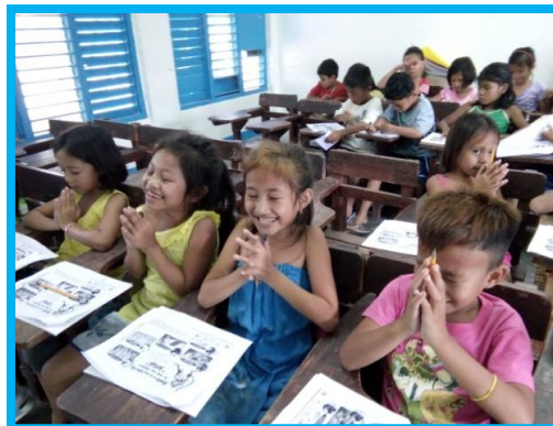
"Sprinters" praying to receive Christ Jesus as their personal Savior.