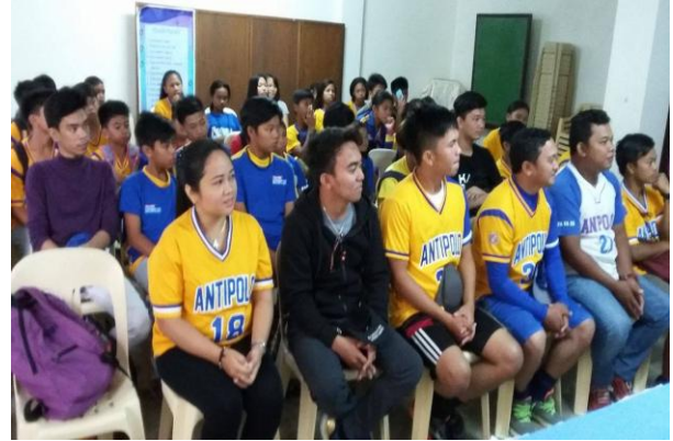
The athletes & trainers with Melo & Rose in our Education Center