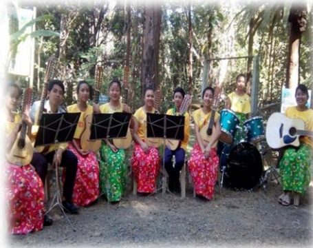
Our Rondalla, in support of the bamboo musicians