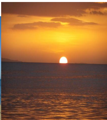
the pleasant summer sun