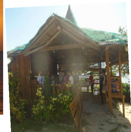
one of the "hiding places"