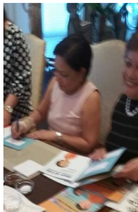
Sen. Cynthia & Aurie going over the plan